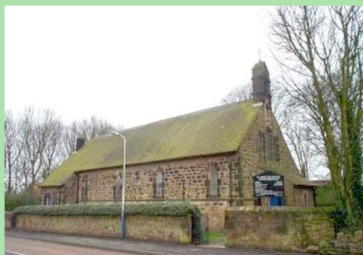
St. John's Backworth