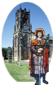
St. Alban's Earsdon