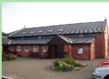
Immaculate Heart of Mary, Parish of Our Lady Star of the Sea