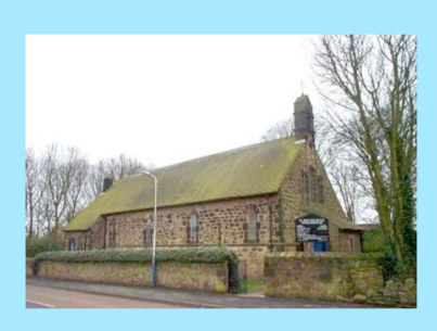
St. John's Backworth