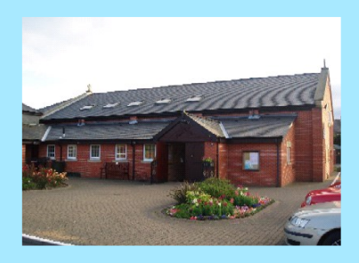
Immaculate Heart of Mary, Parish of Our Lady Star of the Sea