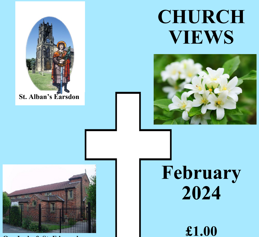
Our Lady & St. Edmund, Parish of Our Lady Star of the Sea