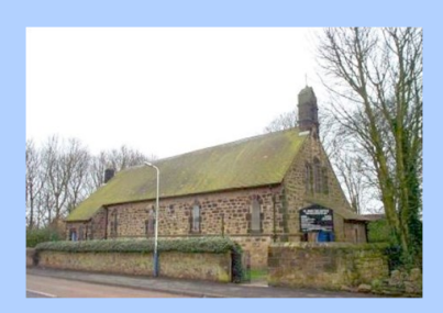
St. John's Backworth